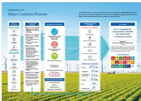
Our Value Creation Strategy