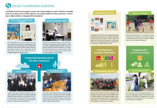
Social Contribution Activities