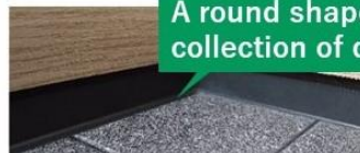
Manufactured by Sinanen

A round shape designed to prevent the collection of dust