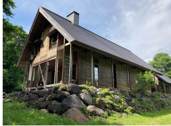
Afan Woodland Trust Office