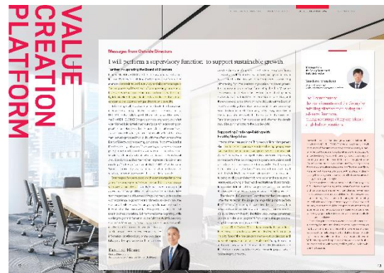
Messages from Outside Directors