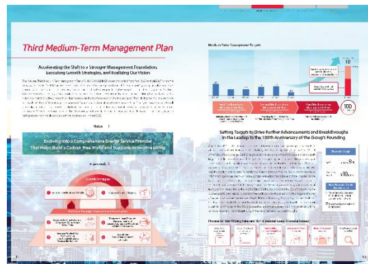
Third Medium-Term Management Plan