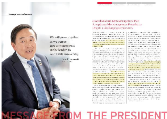
Message from the President