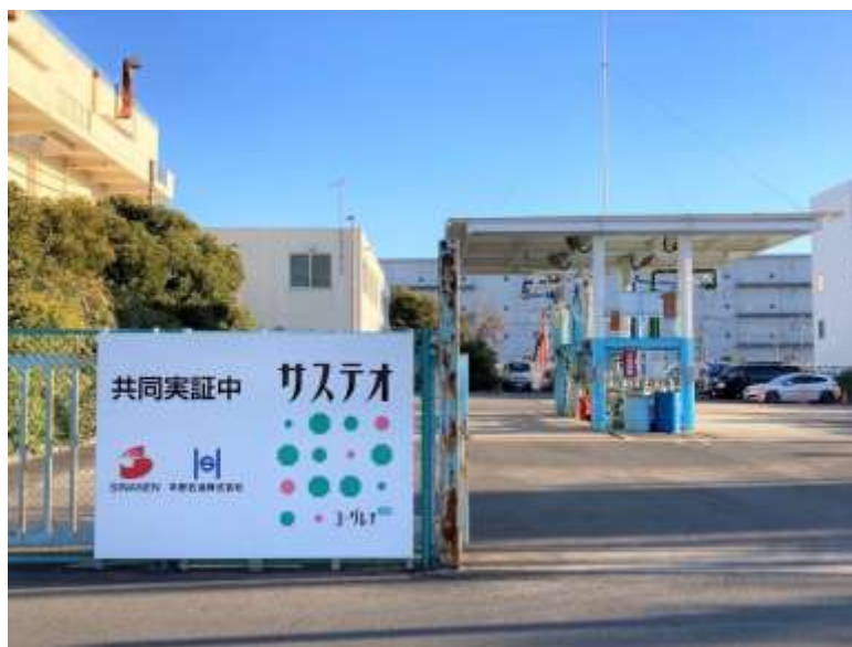
Sinanen Oil Square Tsurumi