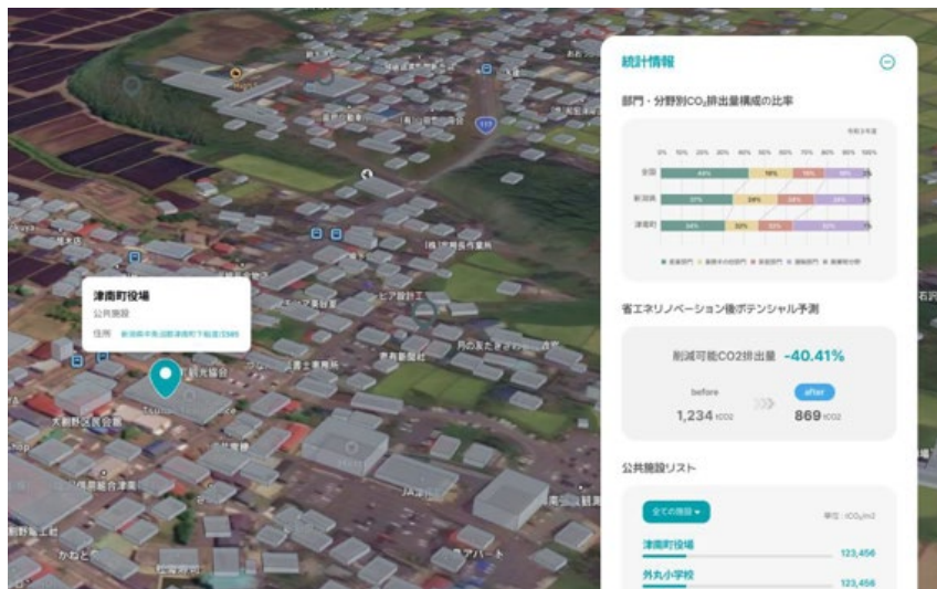
(Demonstration screen for actual system)