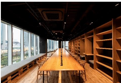
From the left, the 8th floor with the theme of the "past"

This shared office space "seesaw" is centered on young female employees selected in-house as part of a new business of SINANEN HOLDINGS. As a project that utilizes three floors of our former head office building overlooking the Kyu Shiba Rikyu Garden, we have been proceeding with the goal of opening it this spring. As for the "seesaw" name of the shared office space, at this location overlooking the sea, SINANEN HOLDINGS wants to create something that can move society with a gathering of people based on the principle of leverage like seesaws seen at playgrounds. With the etymology of the English word "seesaw" meaning "to be seen / was visible", and incorporating into the office space the differences in "viewpoint," "field of view," and "vantage point" created by the up-and-down movement of a seesaw, the theme of the 8th floor is the "past" that encourages one to introspection, the 9th floor is the "present" that encourages dialogue among colleagues, and the 10th floor is the "future" that encourages much divergence by developing ideas.