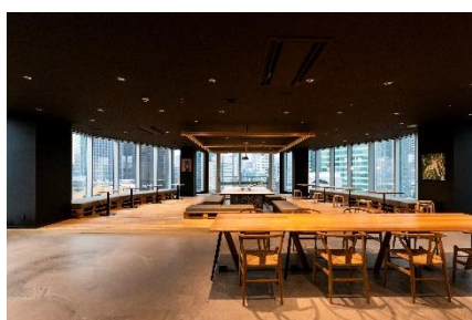
9th floor with the theme of the "present"